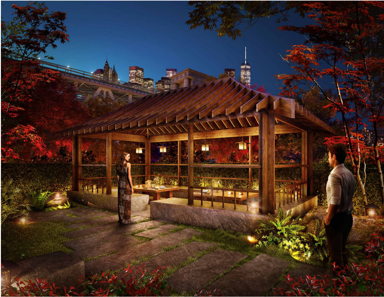
One Manhattan Square