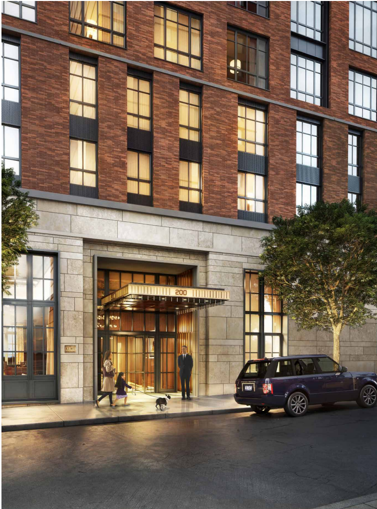
The Kent

Luxury Real Estate has become incredibly competitive. Nowadays all high-end properties are equipped with facilities that benefit the property and sumptuous lifestyle of residents. Media rooms, fitness areas, sustainable devices have now become habitual. Developers and builders have therefore refined their offer, to satisfy the most unusual desires of property owners.