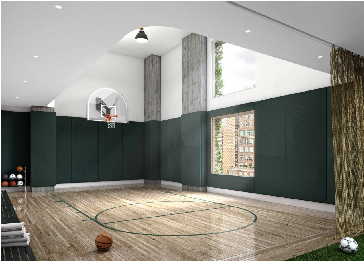
180 East 88th Street Rendering Credit: March Made for DDG