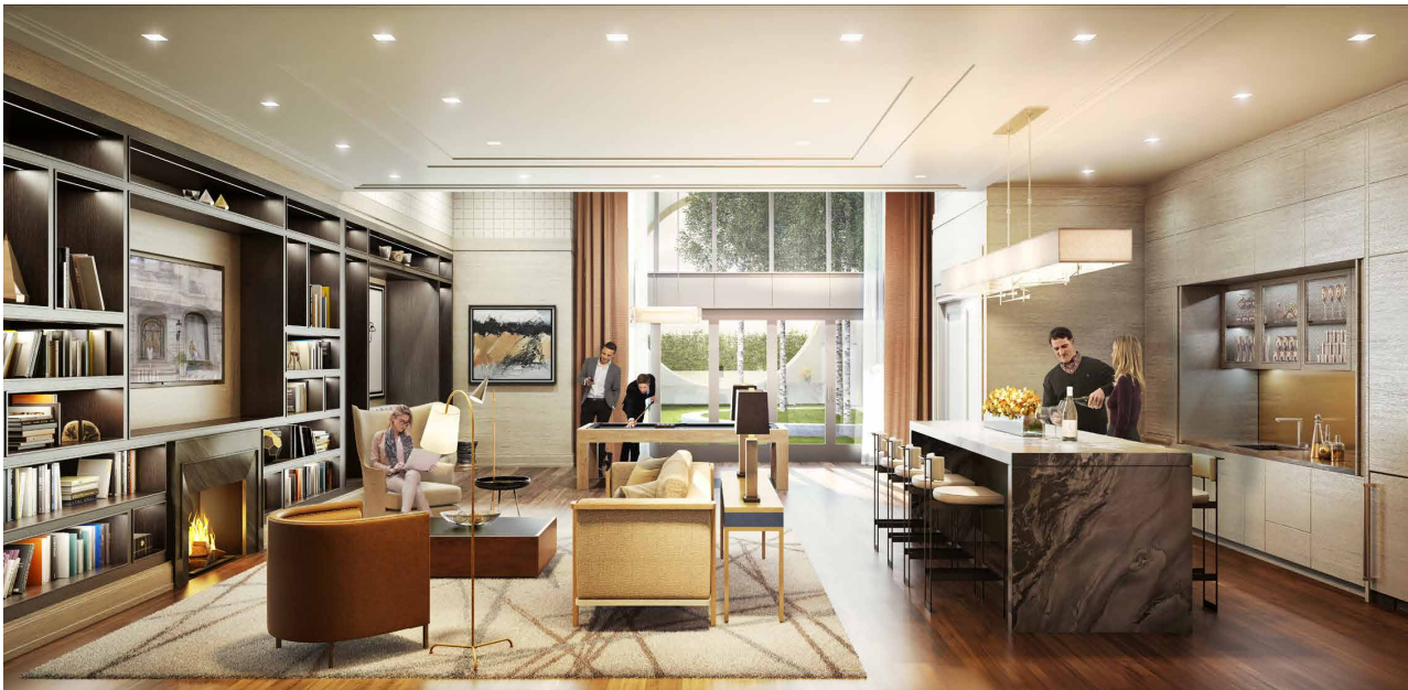
The Kent