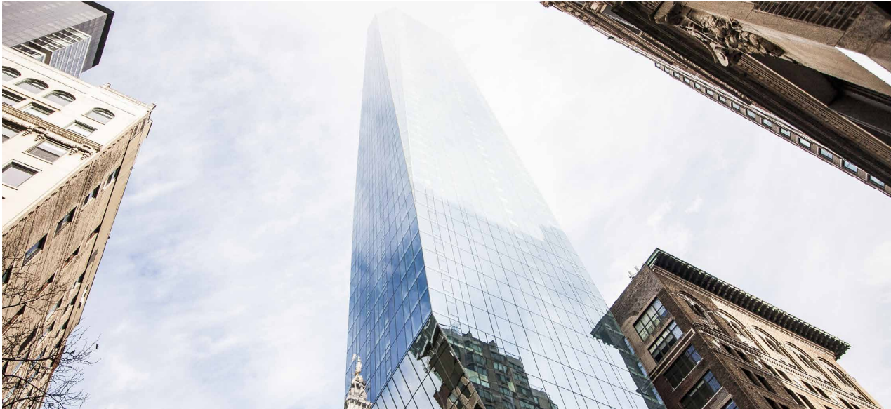
Madison Square Park Tower