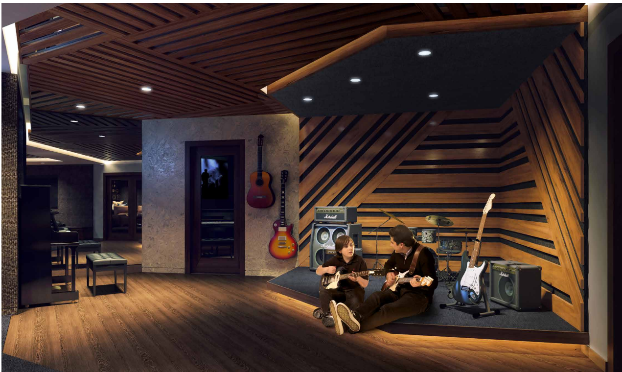
The Kent