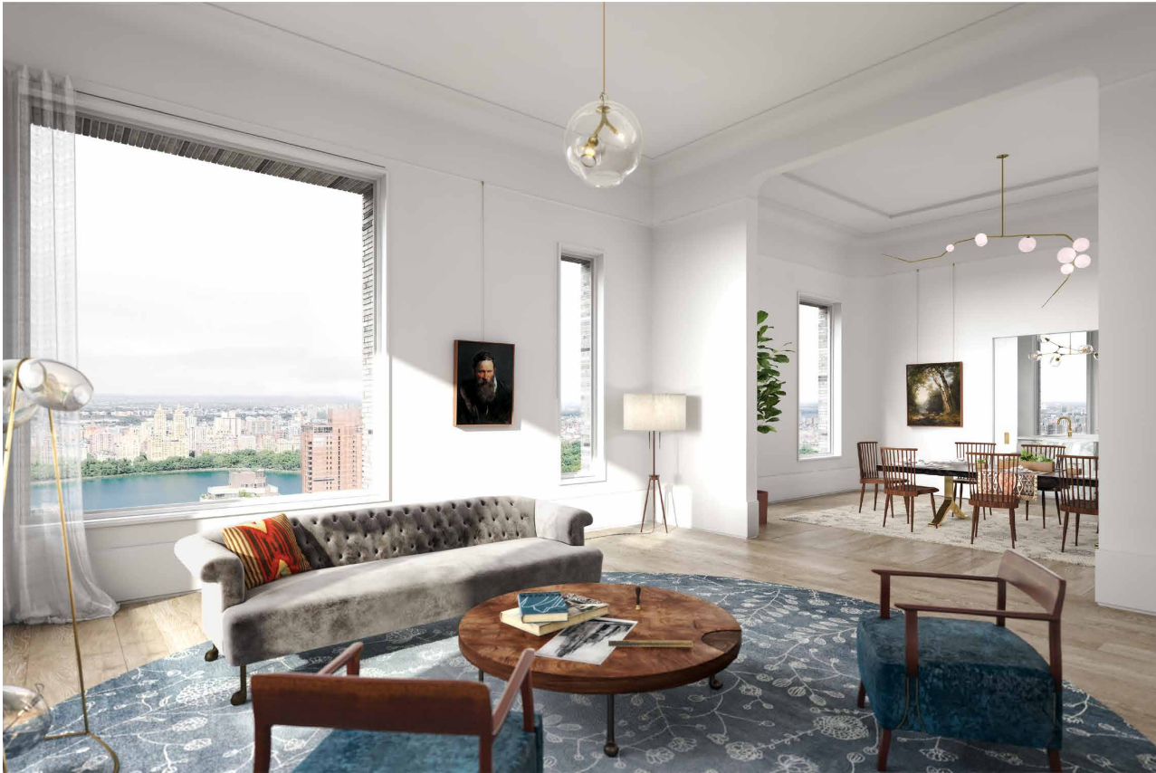
180 East 88th Street Rendering Credit: March Made for DDG