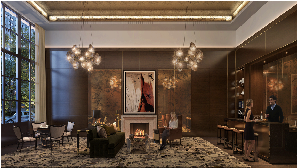
Lobby lounge at the Kent.

A leafy haven known for its venerable museums, high-end boutiques, and close proximity to Central Park, the Upper East Side has a reputation for being one of Manhattan's most charming—and, admittedly, staid—neighborhoods. Recently, however, the entire city seems to be heading uptown. With the opening of the first phase of the long-awaited Second Avenue subway line earlier this year, an influx of new establishments with a downtown sensibility is turning this sleepy enclave into the city's hottest place to be. Here's a look at the restaurants, residences, hotels, and museums that are defining the new Upper East Side.