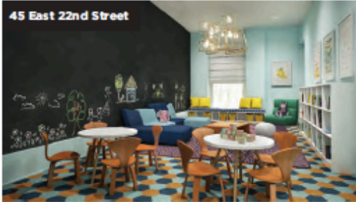
45 East 22nd Street