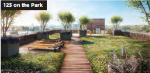
123 on the Park

layouts while offering Hudson River and city views. Amenities include a 24-hour doorman and concierge, fitness center, two lap pools, spa and treatment rooms and a club level floor with entertaining spaces, lounge bar, wine tasting room, private storage and a state-of-the-art children's playroom. The building offers immediate occupancy and is steps away from the finest restaurants and shopping. 10barclay.com