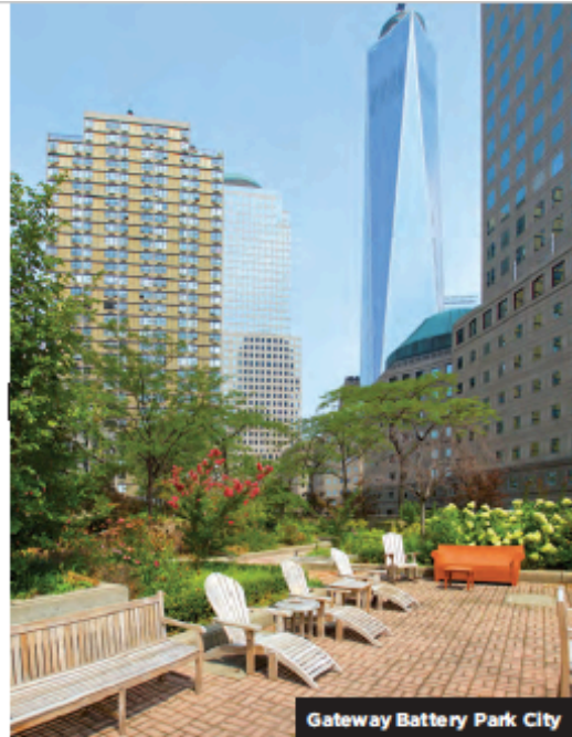
Gateway Battery Park City

This 65-story glass tower features a manor house-inspired granite base and top-heavy silhouette reaching 800 feet in the sky. Floor-to-ceiling windows boast iconic panoramic views of the Empire State Building, Chrysler Building, the clock tower at 1 Madison Avenue, World Trade Center, the Hudson and East Rivers, and Madison Square and Gramercy Parks. Its prime downtown location is walking distance to